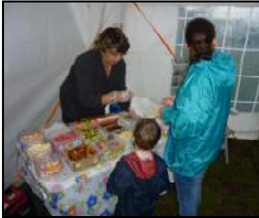
Above – The Tuck Shop was available all Weekend