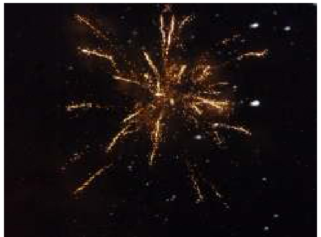
The Fireworks themselves a “ Fantastic Display ” lasting around 20 minutes