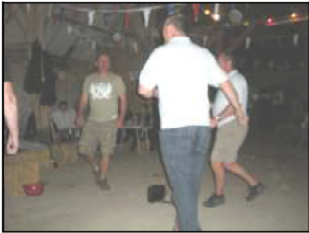
Strange people dancing round their handbag

The Harvest Supper and entertainment in the evening were excellent. It became obvious that EKC has a lot of dedicated and hard-working followers. There was an easy banter and lots of fun to be had on and off the dance floor.