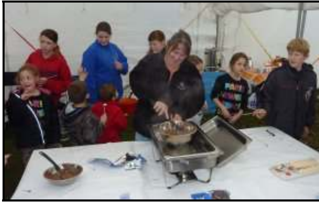
Chocolate Apple Time