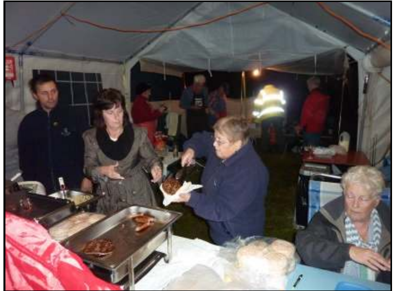
Above – The Kitchen and Staff hard at work