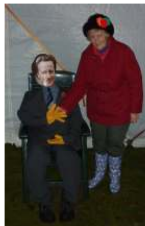
Extreme Left The winners with their Guy – Many hands make light work!