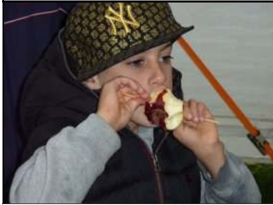
Nothing Like a Chocolate Apple Jake